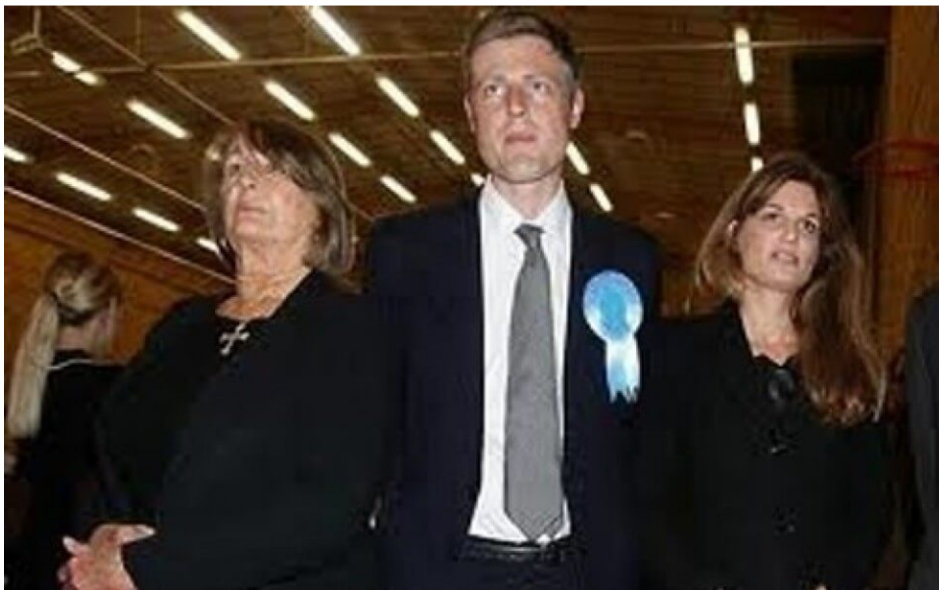
Zac Goldsmith (married to Kate Rothschild) winning the election with sister, Jemima Khan (nee Goldsmith)(right), and mother, Annabel Goldsmith