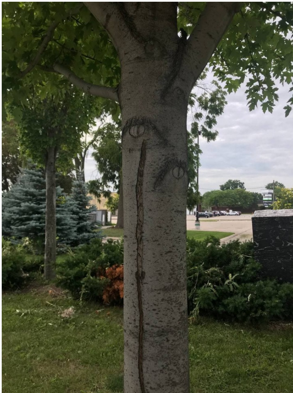
Crying tree - Ontario, Canada, 2021

The war on virus is meant as a crucial background of destabilization and fear which helps extract huge amount of public spending in the name of saving lives, saving environment and saving people's livelihoods-which are all under attack by the savagery of the very capitalist domination. Since the war on virus is largely targeting the public money, we are bombarded with an unprecedented amount of wholesale propaganda narratives, as if we are thrown into the process of corporate electoral process-we are supposed to vote yes to those lucrative capitalist fixes for the capitalist problems by going along with the narratives. Public outcries against the policies are safely consumed among the populations as people are forced to fight among themselves. Moreover, the war on virus is meant to be a perpetual war. Inconceivable "mistakes" will be made, victories would be declared here and there, facts will be revealed when convenient, while much of the facts are distorted to prop up the pretense of this vast protection racket scheme by the oligarchs. One step forward, and one step backward, our lives swirl within the torturous theater of the "medical crisis," but the real solution is never to be found within it. The empire can not lose the war but the empire has no intention of winning the war either, for the winning can destroy the domesticated momentum