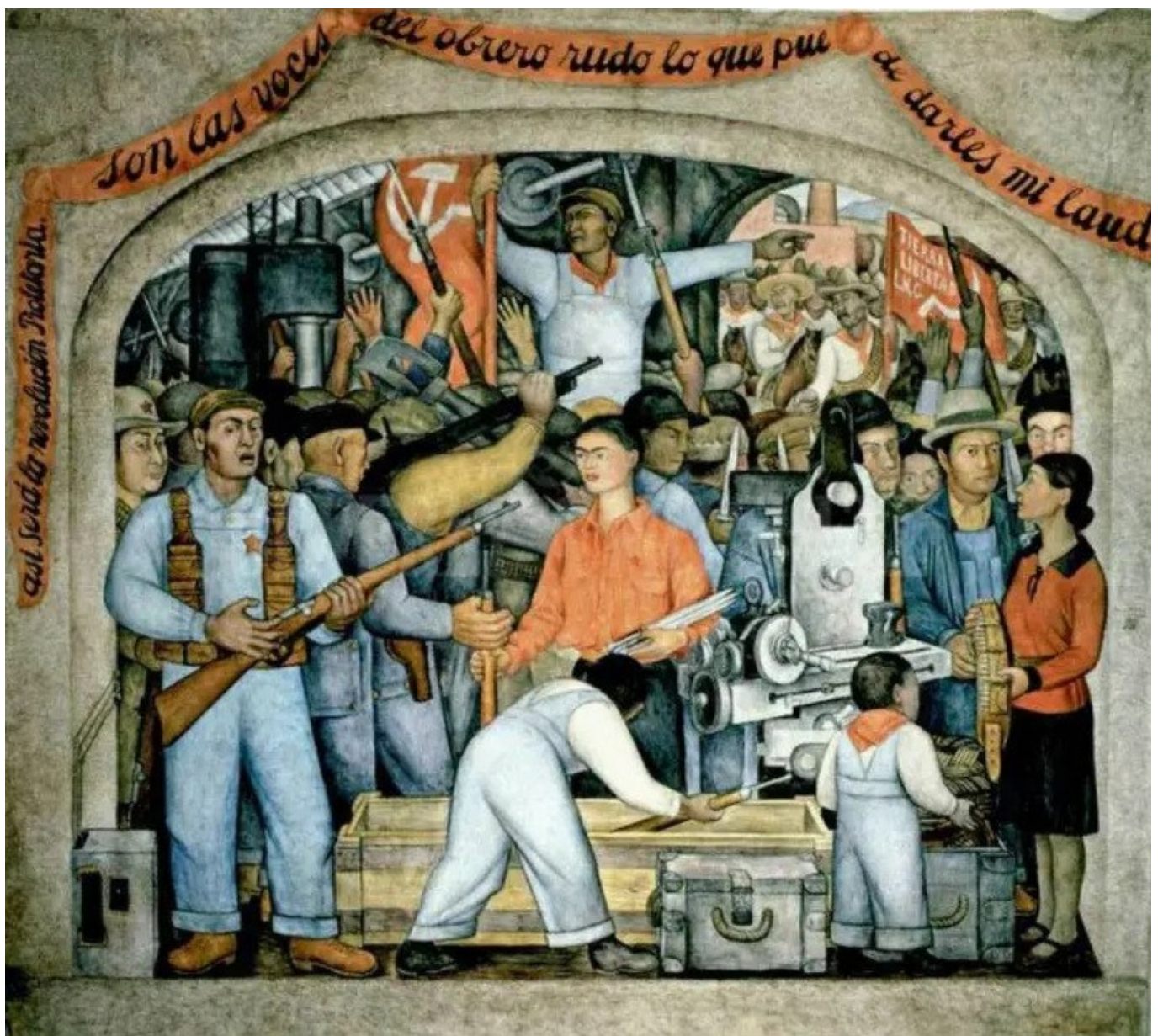
The Arsenal, 1928, Diego Rivera

As we operate within social media outlets, as we present our identities within their frameworks, and as we are injected with genetic modification drugs to modify our physical response to the natural world, we have already stepped into a dangerous stage which might very well spell the end of our species as we know it.