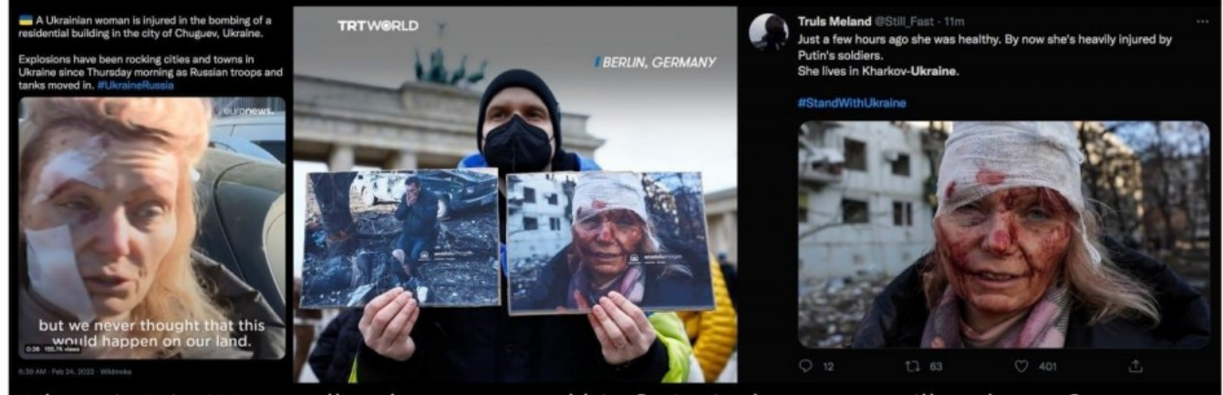
Where is Eric CIA-ramella when you need him? Or, is that name still verboten?

2018 Gas explosion in Ukraine used as western front page war propaganda. Amateur hour at MI5 and the CIA.