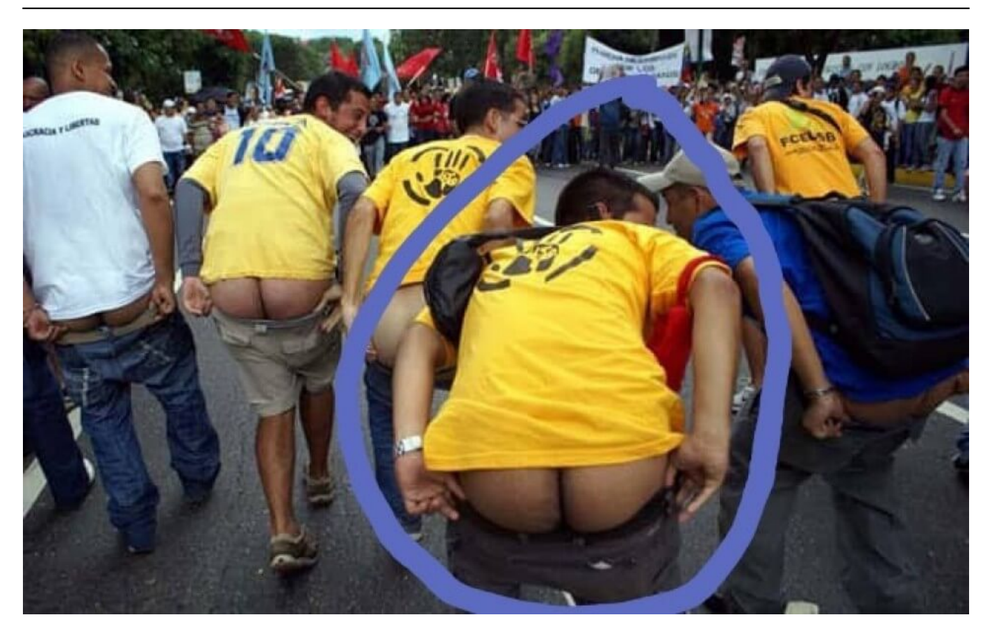
Is this the ass that Trump wants to install in Venezuela's seat of power?

That year, Guaidó exposed himself to the public in another way, founding a political party to capture the anti-Chavez energy his Generation 2007 had cultivated. Called Popular Will, it was led by <a href="Leopoldo López">Leopoldo López</a>, a Princeton-educated right-wing firebrand heavily involved in National Endowment for Democracy programs and elected as the mayor of a district in Caracas that was one of the wealthiest in the country. Lopez was a portrait of Venezuelan aristocracy, directly descended from his country's first president. He was also the first cousin of <a href="Thor Halvorssen">Thor Halvorssen</a>, founder of the US-based Human Rights Foundation that functions as a de facto publicity shop for US-backed anti-government activists in countries targeted by Washington for regime change.