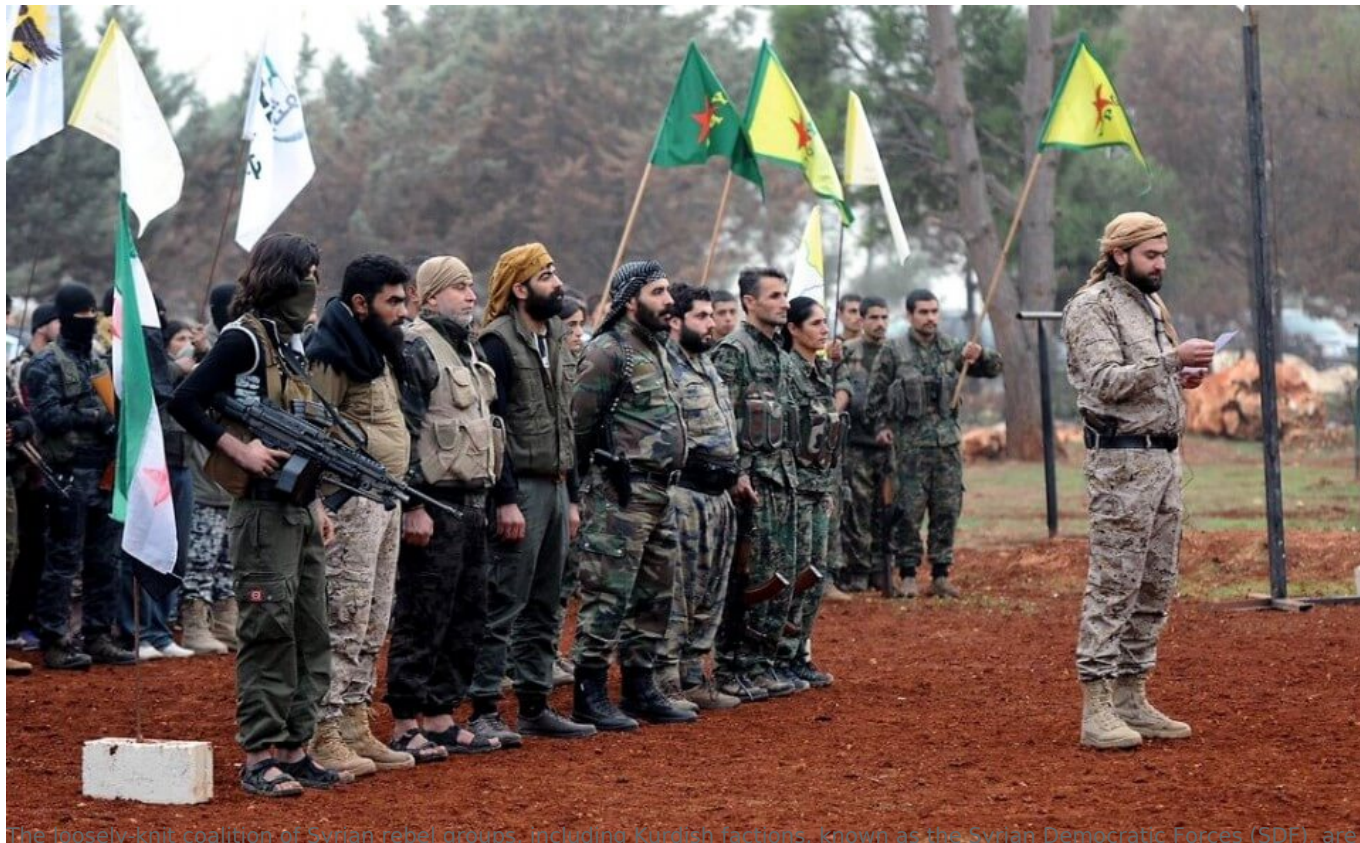
The loosely-knit coalition of Syrian rebel groups, including Kurdish factions, known as the Syrian Democratic Forces (SDF) are armed, trained and backed by the U.S.

But in northeastern Syria, many Kurds have defected to the U.S.-led SDF where arms, salaries, and training are provided by the U.S. Syrians consider the Kurds who have remained loyal to Syria as their fellow Syrian brothers and sisters and the descriptions of Kurdish treachery in this article do not apply to them. The loosely-knit coalition of Syrian rebel groups known as the Syrian Democratic Forces (SDF), are armed, trained and backed by the U.S. The group is currently engaged in the early stages of battle in the ISIS stronghold of Raqqa, Syria.