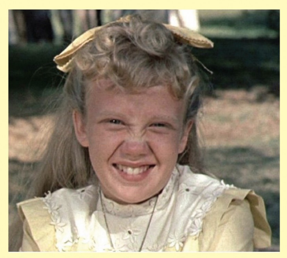
"When you look for the bad, expecting it, you will get it. When you know you will find the good—you will get that..."

-Quote from "Pollyanna" by Eleanor H. Porter, 1913 -Image from Disney film, 1960