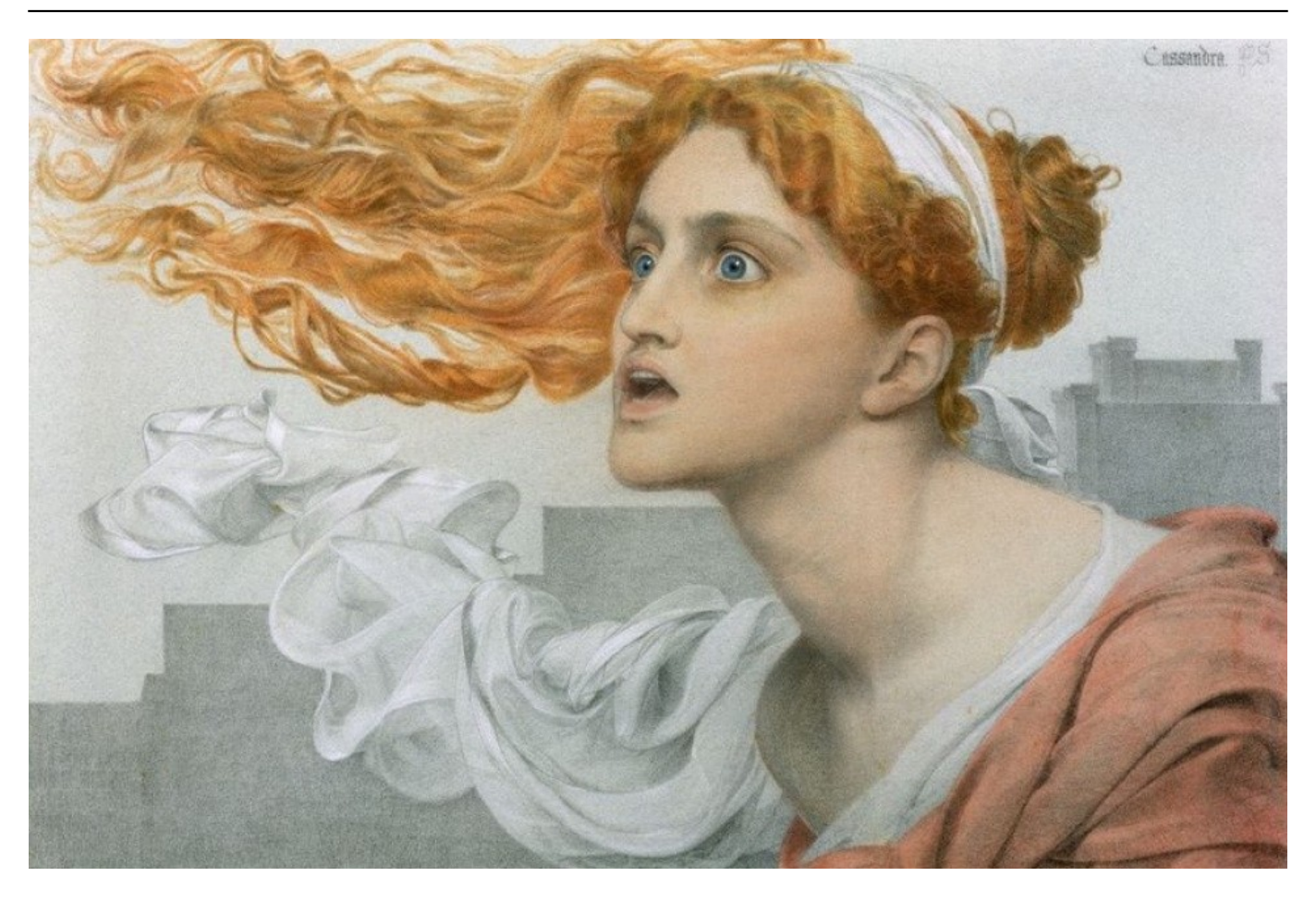
CASSANDRA - "Do you prefer your whole country be vaporized while you sing Kumbaya"?

These self-styled pundits say that Russia should simply ignore the plethora of concrete evidence of imminent war, and waste time holding further diplomatic meetings with the same nazis who have threatened their very existence for a century, who have murdered civilians in Donbass for the last 8 years, including the 298 civilians on MH-17, (and then falsely blamed and sanctioned Russia for it) the same ones who directed ISIS cannibals to commit the false flag mass murders in Syria to create a Syrian "chemical weapons" narrative, then used the same bogus line in the UK with the laughable "Novichuk" fabrications. "Yes," they say, "if only Russia can just sit down in friendly dialogue with their mortal enemies once again, then perhaps a "peaceful transition" may someday be achieved. We can only hope, peacefully praying and gently swaying, all holding hands together while we all sing Kumbaya."