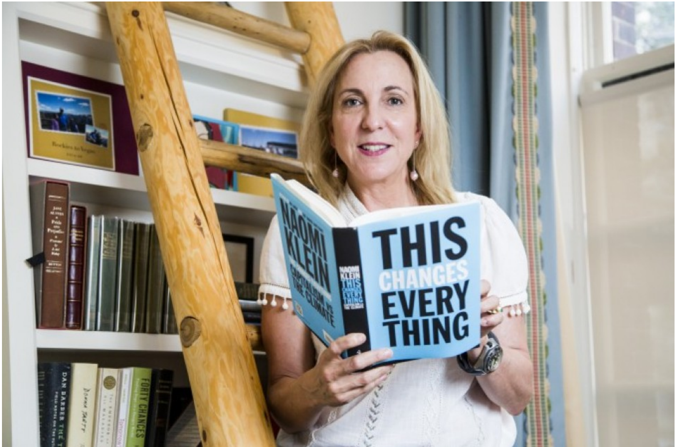
Klein's 2015 book and film "This Changes Everything", was initially launched as project "The Message"

What explains Naomi Klein's current silence on, and even deflection from, crucial issues? Once perceived as the spokesperson for street activists of the anti-corporate globalization movement, Klein now works as the Facebook and Ford Foundation -sponsored Gloria Steinem Endowed Chair in Media, Culture and Feminist Studies at "Public Ivy" Rutgers University. She promotes a version of the Green New Deal that's guided by the Rockefeller Brothers Foundation through her organization 350.org. Klein's devotion to this "sustainable" program (which relies on neocolonial technologies like carbon-capture storage , lithium strip-mining , and even nuclear power ) recently led her to coordinate a censorship campaign against the documentary Planet of the Humans -an investigative film covering corporate influence on the Green New Deal. But it gets spicier: Klein's own environmental film The Message (This Changes Everything) was funded largely by Eric Schmidt (" The Schmidt Family Foundation ")-the very Google executive whom she purports to have exposed as a Covid corporatist.