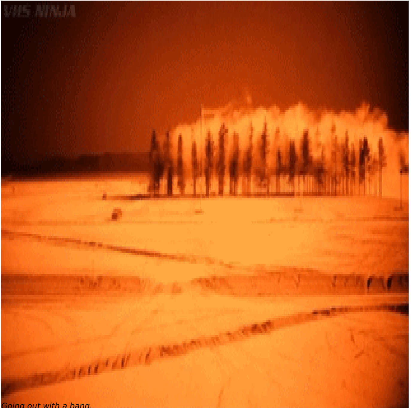
Going out with a bang.

of similar 19th Century gatherings to carve up the world for capitalism. Then, as now, indigenous territories and resources were targeted for expropriation through coercion, with Africa being a prime target."