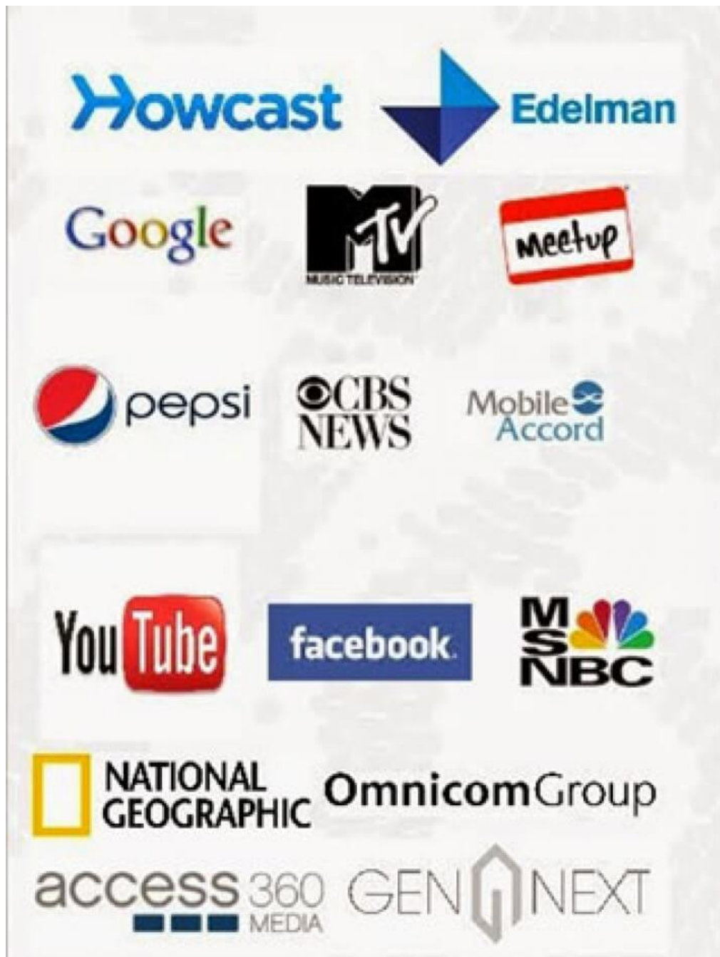
Image: US State Department's "Movement.org" helped train hundreds of operatives years ahead of US-backed subversion across the Arab World in 2011. Among the many sponsors of this program is Facebook and Google.

Facebook was also an official sponsor of the US State Department's training program preparing political subversion across North Africa and the Middle East years before the so-called "Arab Spring" unfolded. The very activists audiences around the world were told "spontaneously" sprung up across North Africa and the Middle East were in fact trained, funded, and equipped by the US State Department and various corporations including tech giants Google and Facebook years beforehand.